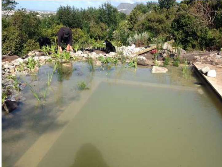
25 September, 2013. Planting in the bio-filter commences. The filtration pumps have yet to be switched on.