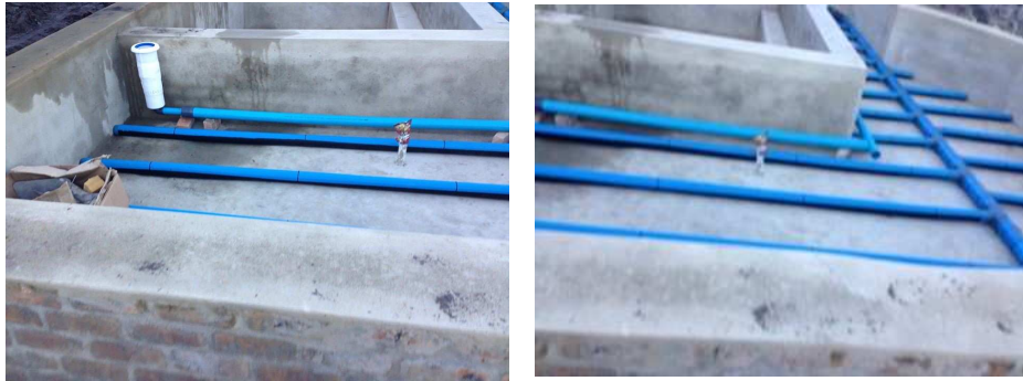
10 July. Pipes are laid at the base of the bio-filter. On the left is the elevated skimmer box. The biofilter will later be filled with fine stone, in which the plants will be grown. The concrete needs to set for a couple more weeks.