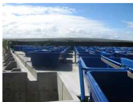
Tank installation on an abalone farm