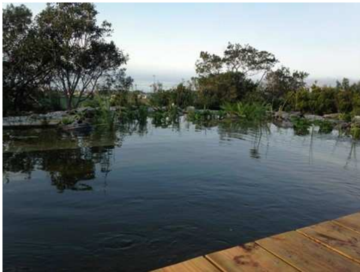
Late October, 2013. Crystal-clear water! The bio-filter is doing its job!