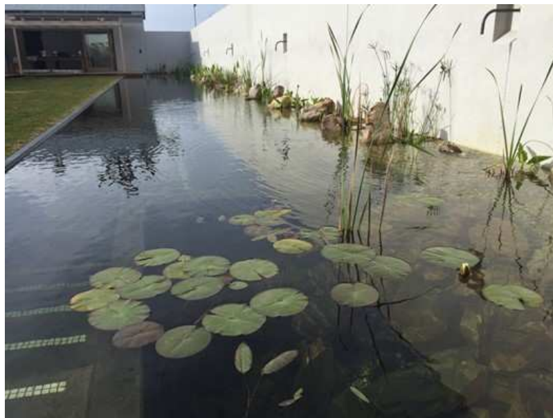
A newly-built eco-pool in Hermanus. The swimming pool [left] is long and narrow, for swimming laps. The bio-filter is on the right. Lilies grow in deeper water.