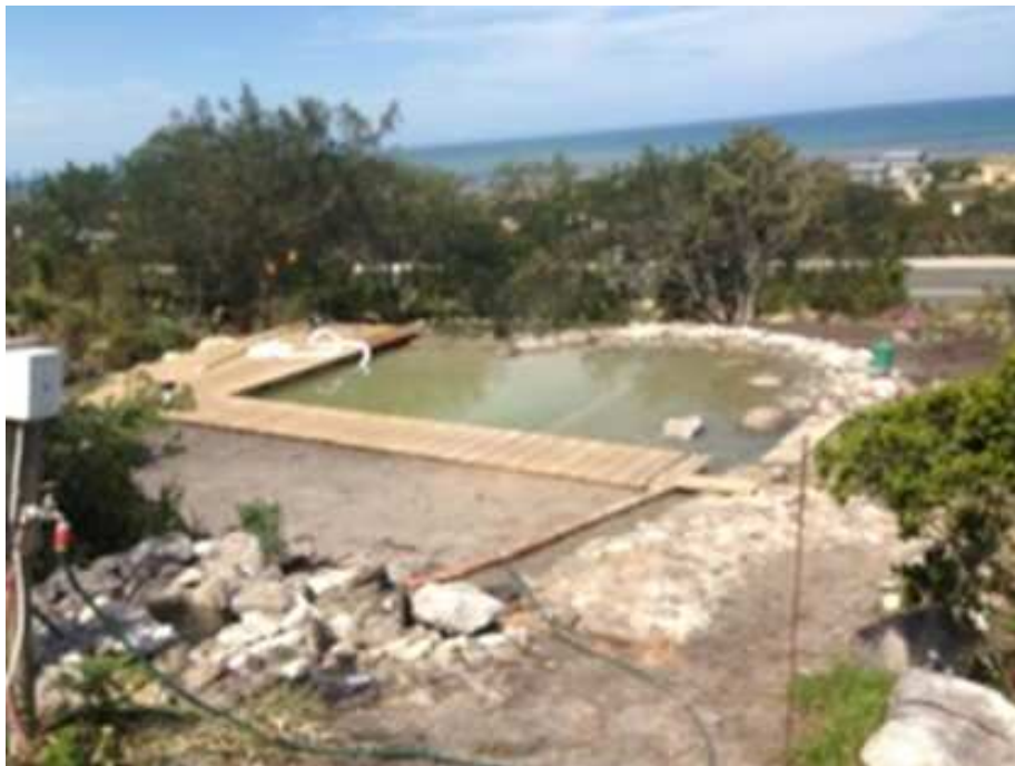
24 September, 2013. Decking has been laid and rocks and big stones have been positioned to soften the edges of the bio-filter. Tap water has been used to fill the pool. Let the planting begin!