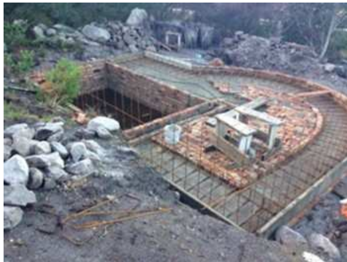
9 June 2013. The site is on a mountain slope and an excavator was used to shift rocks.. Construction has begun. The rectangular section will become the swimming pool. The rest will eventually become the bio-filter.

Grant’s first natural pool was built in Betty’s Bay and below is a photo-tour of the process.