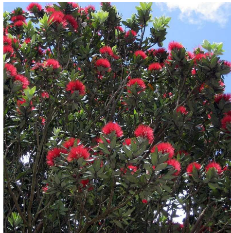
New Zealand Christmas tree: Metrosideros excelsa

It's official. The Kogelberg branch of the Botanical Society has declared that the New Zealand Christmas Trees is Public Enemy #1. Let the battle commence!