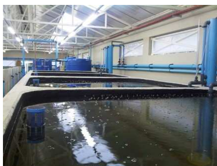
Tilapia brood stock in Caprivi, N. Namibia.

The aquaculture industry, though in its infancy in South Africa [less so in other parts of the world], is going to become of critical importance in the years to come. Natural fish stocks are dwindling fast and the world's population is ever expanding. Food stability will be one of the greatest challenges of the future and fish farming will inevitably become more and more vital.